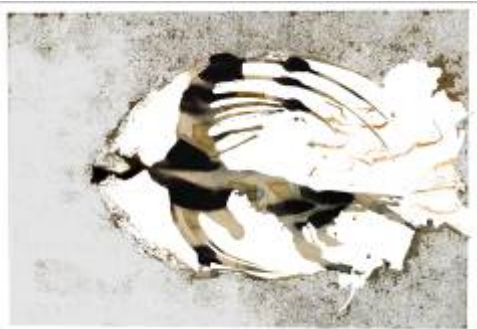
47. Anna Eichler “Arctic fishbone II”, 100x70, digital print