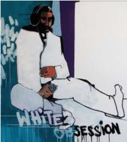
36. Sabina Twardowska “White obsession” from the “Colours” series, 90x100, acrylic on canvas