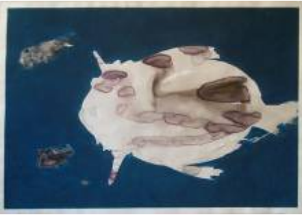
45. Anna Eichler “Snailfish”, 100x70, digital print