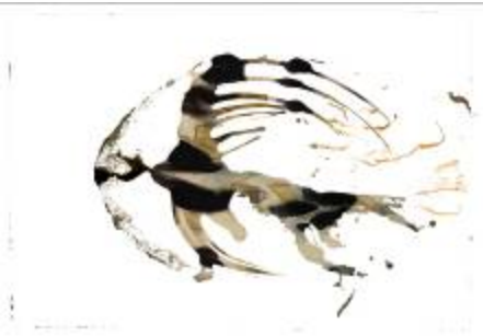
46. Anna Eichler “Arctic fishbone”, 100x70, digital print