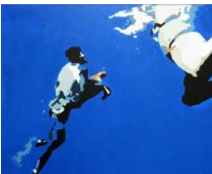
39. Zbigniew Sikora Under water III, 100x120, acrylic on canvas