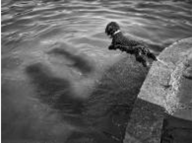
16. Paweł Stelmach photograph no 15, 30x40, collector's print