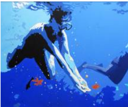
38. Zbigniew Sikora Under water II, 100x120, acrylic on canvas