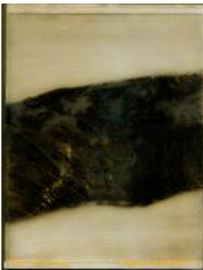
19. Magdalena Janus “In depths no 2” from the “Off-time” series, 18x23,5 artist's technique