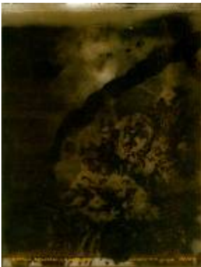
18. Magdalena Janus “In depths no 1” from the “Off-time” series, 18x23,5 artist's technique