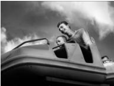
17. Paweł Stelmach photograph no 16, 30x40, collector's print