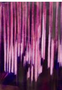
49. Janusz Trzebiatowski “The forest”, 50x70