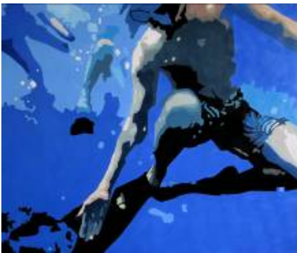
37. Zbigniew Sikora Under water I, 100x120, acrylic on canvas